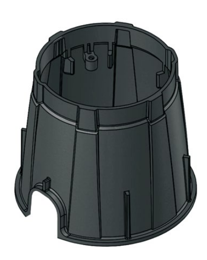
Pipe hole: 2-1/2 in. X 3-1/4 in