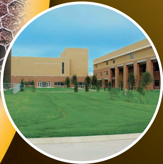
Brewer High School before and after Tufftrack™ Installation