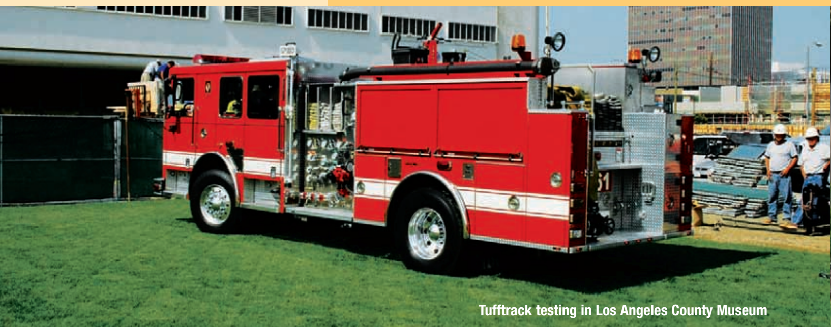
Tufftrack testing in Los Angeles County Museum

Tufftrack produces an aesthetically superior alternative to hard surface pavements, with the benefits of an environmentally sound solution. Tufftrack reduces storm water runoff and allows moisture to filter naturally through the soil, reducing ground water contamination and eliminating the need for large drainage systems. The heat absorption and light reflectivity of an area using Tufftrack are great benefits to the surrounding vegetation and buildings.